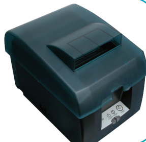
Optional Splash Proof Cover