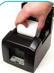
Easy Drop-In & Print