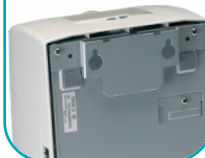
Vertical Wall Mount